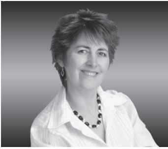
Carol Hughes, MP Algoma-Manitoulin- Kapuskasing

If you like to fish, your overhead costs are going up along with those for many other consumer goods thanks to a new tax regime in the budget. The reason this is happening is because of a new set of tariffs being introduced to pay down the deficit. While tariffs can be an effective tool to protect domestic production, these are being placed on items we import because we no longer make them or never did. Used in that way tariffs are nothing more than another level of taxation. To be clear, these are taxes under a different name. Tariffs can be levied on items as they enter the country or leave for export – usually to meet trade conditions. The government has reduced import tariffs on certain items which they are promoting heavily. They aren't bragging about the tariffs that are expected to bring in more than $300 million a year though.