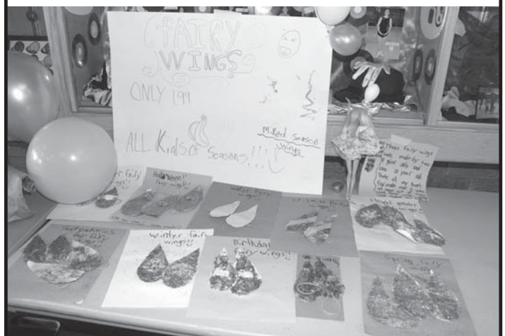
Photo: Paige Eadie invented Barbie "Fairy Wings." The wings are interchangeable, come in a variety of styles to suite the season or holidays.

LAMBAC's Kids Invent program ran the week of July 22-26 in Espanola. Participants learned about entrepreneurship, marketing, and brainstorming for new toy inventions. The program closed with a Toy Fair, which was open to the public. Some of the young entrepreneurs even managed to sell some of their inventions.