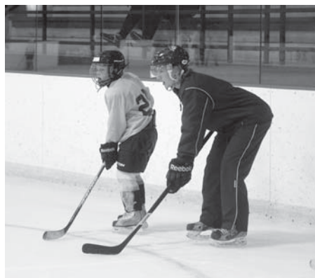
Photo: Players assisted hockey school students with on-ice drills.