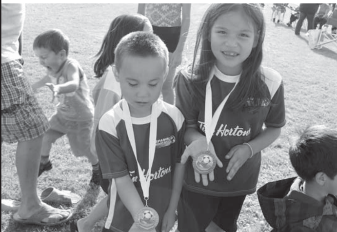
Photo: Timbits soccer players were happy with the medals they earned.