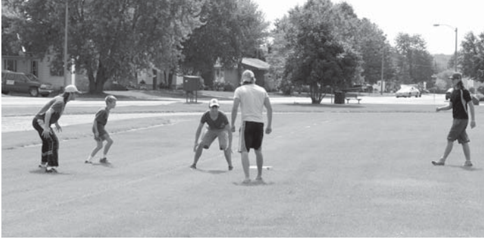
Photo: Espanola Rivermen players and hockey school students engage in a friendly game of capture the flag.

The Rivermen held team try-outs the week prior to hockey school and players were seen doing running drills at the track. Their regular season begins on Friday, September 6 in Kirkland Lake. The Rivermen will drop the puck on their first home game Friday, September 27 against the Sudbury Nickel Barons. For ticket information, call 705-869-1961. For the complete 2013-2014 NOJHL schedule, visit www.espanolajuniorhockey.ca .