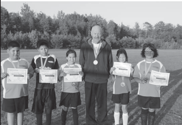
Photo: The U12 soccer champions show off their medals and individual achievement awards. The team won in a shoot-out.