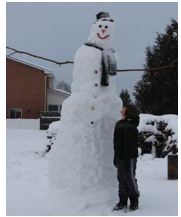
Photo: Super snowman? Some children (with help from adults with a step ladder) got very ambitious with all of the early season snow we've received. This ten foot tall snowman resides on Polojko Drive in Espanola.