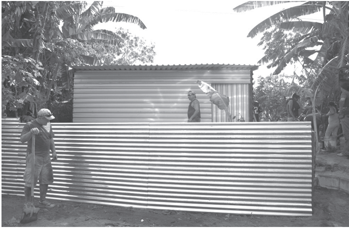
Photo: 14' x 16' home, complete with new fence and garden.

while there. In addition to helping build a home for the family, they renovated a ministry building that would serve as a safe shelter and place for prostitutes and addicts to clean up, prepared and delivered meals to the homeless, and helped host a New Year's Eve barbecue