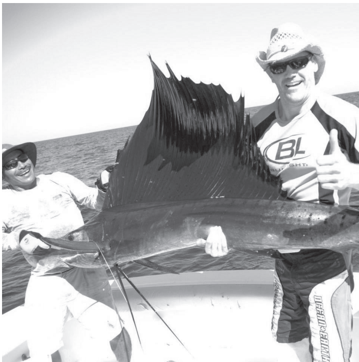
Photo: It took a little muscle to bring this one in...but Marlins are catch and release. All the tuna that was caught, however, was eventually consumed by homeless people.