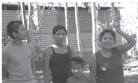
Photo: Single mother of three who is now the proud owner of her own home.

Follow up story...By Chloe Kneer -- Having a roof over your head, a floor under your feet, and a door to keep the elements out when you come home is something you no doubt take for granted. In some parts of the world, however, just these basics are a luxury. One lucky San Salvador family, a single mom with three children, were blessed with a home of their own this holiday season. They had been taking shelter under the neighbor's makeshift roof, but they are now proudly calling their new 14' x 16' steel-clad building home.