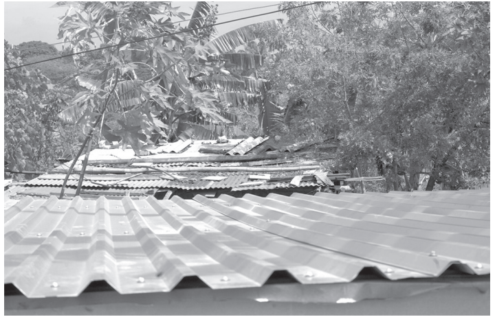
Photo: The makeshift roof in the background is the former shelter for this family of four.

for an orphanage. It was mostly work, but they managed to squeeze in a day of fishing...a bounty of tuna that was later used to feed more homeless people. A picture is worth a thousand words, so enjoy this photo diary.