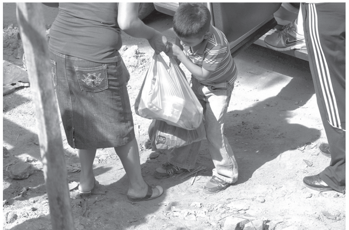
Photo: Volunteers took the family on a shopping spree to Wal Mart. The youngest son was so excited he insisted on carrying all of the bags.