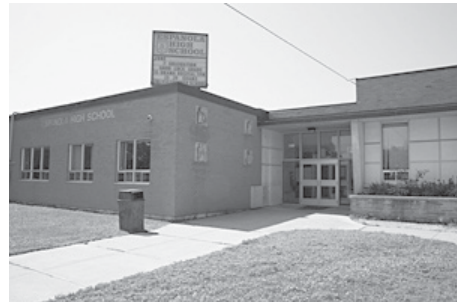
Photo: The current Espanola High School might soon be the site for both the high school and A.B. Ellis Public School.