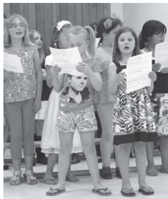
Photo: Grade 1-4 Choir singing.