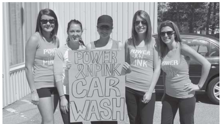
Photo: Relay For Life team "Power In Pink" held a car wash to raise funds for the Espanola Relay For Life, being held June 14 at the Espanola Recreation Complex. The relay runs from 7:00 p.m. to 7:00 a.m. to increase funds and awareness for cancer. 2013 marks the 75th anniversary of the Canadian Cancer Society.