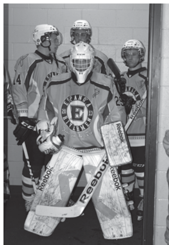
Photo: (Above) Rivermen players waiting to take the ice for the 2nd period of action against the Abitibi Eskimos.