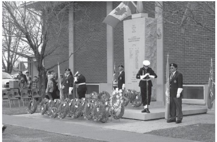
Photo: The Cenotaph at the Espanola Royal Canadian Legion