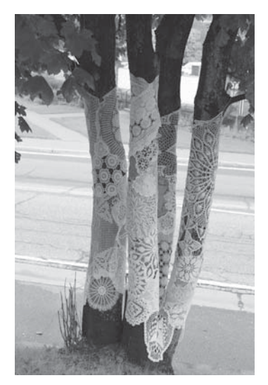
Photo: The Lace Makers tree greets Espanola residents and visitors as they come across the bridge on Highway 6.

The complete Espanola Fibre Arts Festival schedule is available their website at www. espanolafibreartsfestival.ca