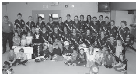
Photo: The Espanola Rivermen hosted a "meet the team" at the Espanola Complex. Here, the team poses with some of their youngest fans.

Espanola Rivermen Junior A Hockey Team Plays Home Opener This Friday