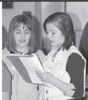
Photo: Santa made a surprise visit to the Espanola Seniors' Drop-In Centre, handing out presents to students of école St. Joseph. The choir performed Christmas classics before the annual seniors' Christmas supper on December 15.