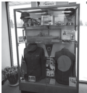
Photo: Espanola Prisoner of War Camp #21 display case has a German battleship carved by one of Espanola's German POWs. There is also a POW jacket with a large red circle sewn into the back of it.