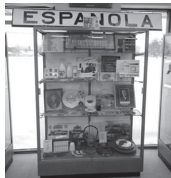
Photo: Showcased are Abe Obey "Espanola's First Citizen" the 1910 Spanish River Train Wreck, Espanola Dairy, Tasso's Store and the Espanola 1925 all Ontario Junior Baseball "Finalists" along with a trophy.

Photo: Espanola Prisoner of War Camp #21 display case has a German battleship carved by one of Espanola's German POWs. There is also a POW jacket with a large red circle sewn into the back of it.