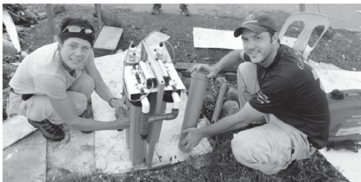
Photo: Assembling the water purification system.