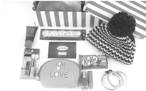
Photo: An example of items to be included in the shoebox.

note of inspiration to the recipient. Once the items are placed inside, simply tie a ribbon around the box (no gift-wrapping, as they must be inspected before being presented to the women.) All items should be