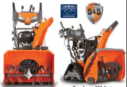
Two Stage 200 Series