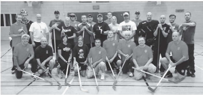
Photo: Espanola volunteer firefighters, police officers, and civilians engaged in an indoor street hockey game to raise money for muscular dystrophy on Friday, October 3 at Espanola High School.

In an initiative to raise money and awareness of muscular dystrophy the Espanola Fire Department and Espanola Police Service created the Third Watch Annual Floor Hockey Tournament which was held on Friday, October 3 at Espanola High School.