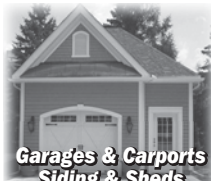
Garages & Carports Siding & Sheds