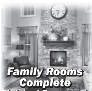
Family Rooms Complete Finished Basements