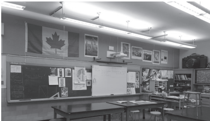
Photo: The visual arts classroom at EHS, complete with Canadian flag at the front.