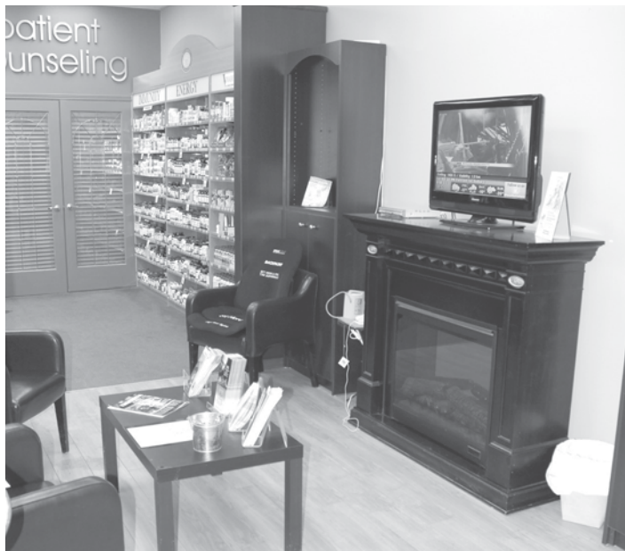
Photo: Waiting room at the new Robinson's Pharmasave Walk In Clinic

Hours for the walk-in clinic are Monday – Friday from 9:00 a.m. – 6:00 p.m. and Saturday from 9:00 a.m. – 3:00 p.m.