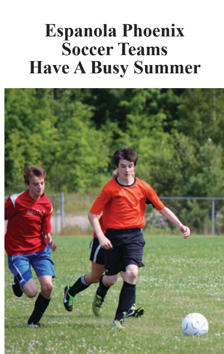
Photo: The Espanola Phoenix were recently in Elliot Lake to play ELMSA and Camp Bil-O-Wood teams.