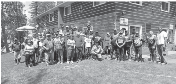
Photo: Riders converged on the Fairbank Lake Resort before heading back to Nairn for a barbecue.