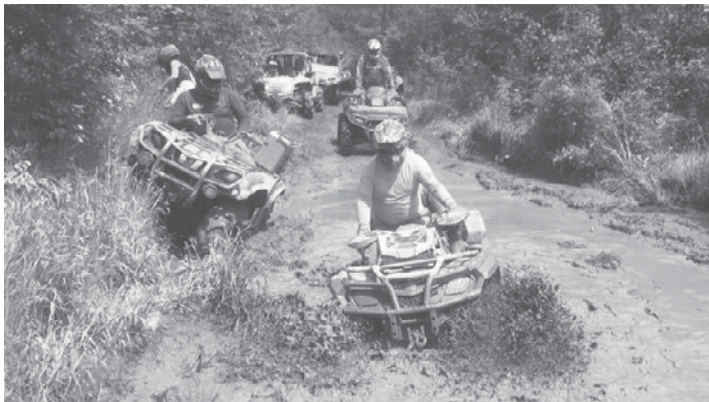
Photo: The weather was perfect and so was the mud along the trails.