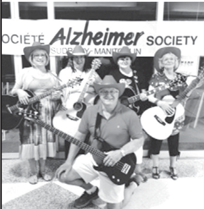
Photo: The Sudbury-Manitoulin Alzheimer Society held a Walk for Memories at the Espanola Mall Sunday, June 7. So far, the group has raised over $1100 for Alzheimers awareness. Participants were treated to live music and a Zumba warm-up.