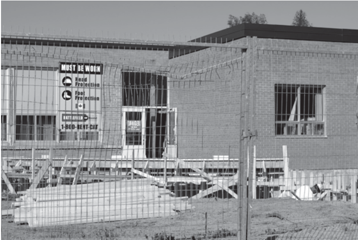
Photo: Espanola High School renovations will continue through the summer.

Work is progressing on the revitalization of the Espanola High School site to accommodate two distinct schools – A.B. Ellis Public School (K to Grade 8) and Espanola High School (Grades 9 to 12). Trustees received a construction update at the Strategic Planning Committee meeting on June 9.