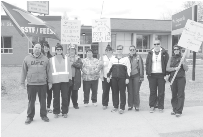
Photo: Espanola High School teachers on first day of strike.

Ontario Secondary School Teachers' Federation (OSSTF – District 3), the union representing secondary teachers and secondary occasional teachers, has been on strike for a little over a week. As a result, the Rainbow District School Board has cancelled all instructional programs for students in Grades 9 to 12. Community use of schools, in the evenings and on weekends, will proceed as scheduled, and students are encouraged to continue their learning