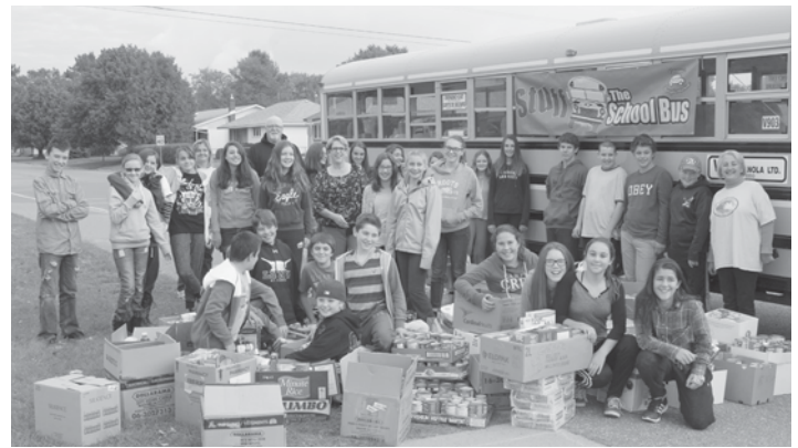
Photo: Ecole St. Joseph students and principal who helped stuff the bus during the 2nd annual food drive.

By Chloe Kneer – Employees of Veteran's Transportation, along with volunteers from the Espanola Helping Hand Food Bank, made the rounds on Tuesday, October 6, in advance of the Thanksgiving Day long weekend, picking up items that area elementary schools and businesses had collected for the 2nd annual Stuff the Bus food drive.