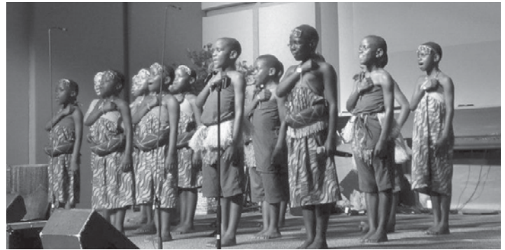
Photo: The African Children's Choir, who have toured all over the world since 1984, recently performed in Espanola. Photo by Aimee Ligi.

The African Children's Choir performed in Espanola last week to a packed house at the Queensway Pentecostal Church. The choir is composed of African children, ages 7 to 10, many who have lost parents to war, disease or famine. Essentially, the choir is a cross-section representative of children on the African continent. However, these children are made aware that their parents' or others' untimely fate does not have to be their own. The choir, and the tours they've taken all over the world, raise awareness to the needs of destitute and orphaned African children, but more than that, shed light, give hope and actively raise money for a better future. In fact, their website, www.africanchildrenschoir.com , features the success stories of children who once sang in the choir, many of whom that have gone on to become doctors, midwives or lawyers.