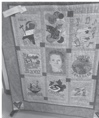
Photo: Everyone is invited to participate in the community art project making story flags, like the one pictured.