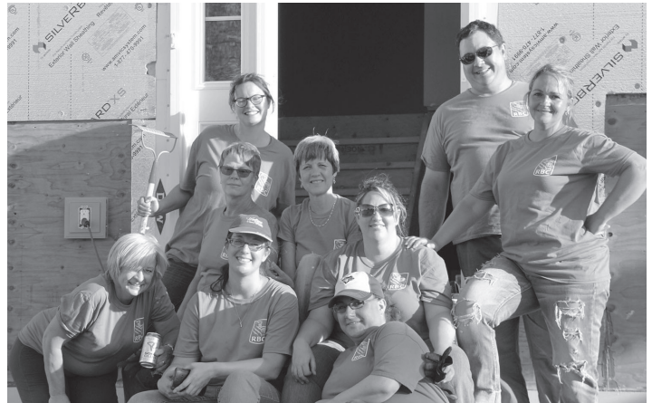
Photo: A crew of ten local Royal Bank of Canada representatives boost the build with family alongside

The Royal Bank of Canada presented Habitat for Humanity with a donation of $10,000 toward its build of a semi-detached on Adelaide St. in Espanola.