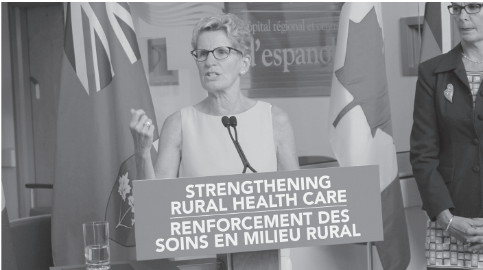
Photo: Ontario Premier Kathleen Wynne makes a funding announcement at Espanola Regional Recreation Complex.