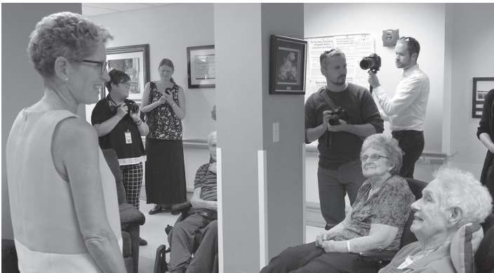
Photo: Premier Kathleen Wynne meets residents at the nursing home.