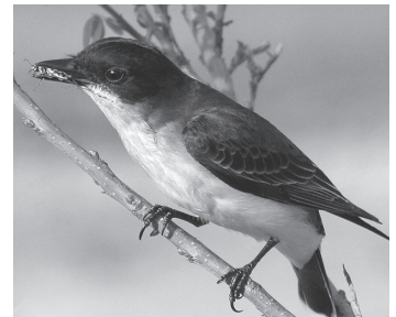
Photo: Eastern kingbird eating.