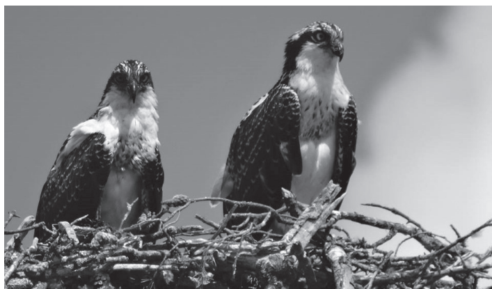
Photo: Two osprey chicks on the edge of the nest at the south end of Espanola. The chicks have since left the nest. Area bird watchers were treated to seeing their development all summer. Last summer, the same nest produced only one chick.

By Bob Rigby – The day has finally come and our two local osprey chicks have left the nest on the south end of Espanola. I saw them perched on the edge of the nest last week, flapping their wings and calling for food that generally never comes. This mom, however, had mercy on her chicks and offered up a minnow after persistent calling. Then, they got the message that it was time to vacate.