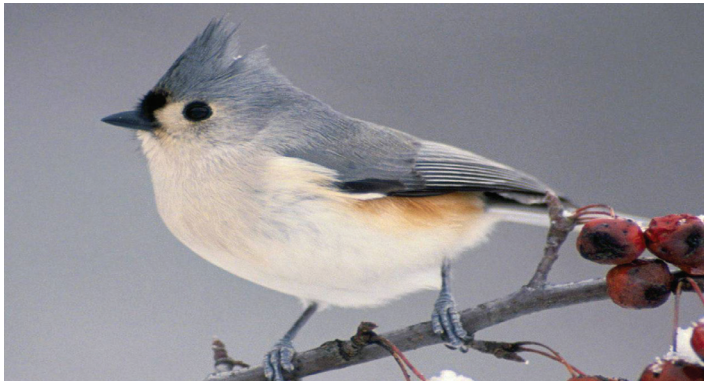
Photo: A tufted titmouse, typically only seen as far north as Owen Sound, but recently spotted in Espanola.

By Bob Rigby - These past few weeks have been spent observing birds on the wing, meaning birds that have started early migration. Just last week while at the Espanola complex field at around 6:00 p.m., I got to see about 30-40 common nighthawks flying at different altitudes, feeding on various swarming insects. On this particular evening, the meal appeared to be a feast of flying ants. This aerial display lasted about a half hour as the birds disappeared out of sight heading in a southerly direction. That same night, I received a phone call from a friend in Killarney who witnessed the same event taking place, but he observed over 200 common nighthawks congregating, and