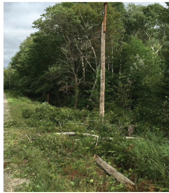
Photo: The top of this hydro pole was broken off on Old Webbwood Road. There was also an uprooted tree on Barber Street and a hydro poll blown over on Highway 17 in McKerrow.