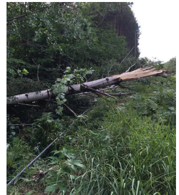
Photo: Snapped trees took down a power line on Old Webbwood Road as a big storm ravaged our area August 20.

Lashing winds and heavy rain hammered our area the weekend of August 20-21 causing widespread power outages and eventually a cool down in temperatures. We have been experiencing such hot and dry conditions that fire bans have been in place most of the summer, making summer a bummer for backyard fire pit aficionados. The weather has also caused havoc for gardeners and smaller