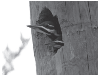
Photo: Pileated woodpeckers in the nest.