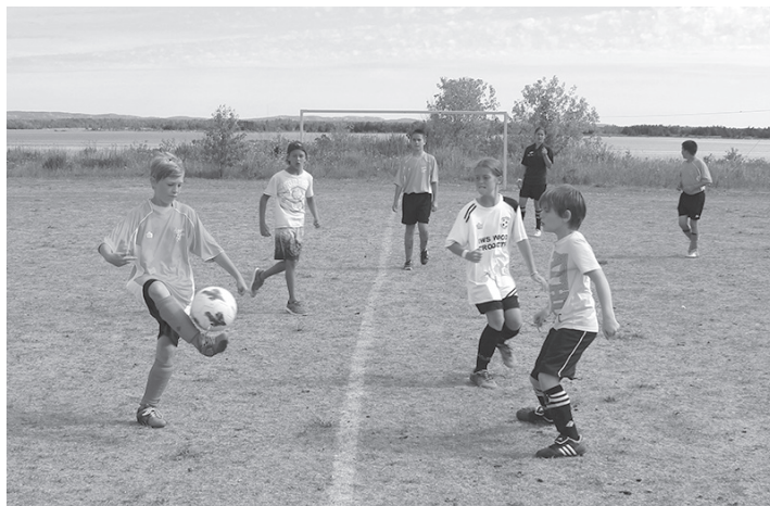
Photo: The Espanola Phoenix, the competitive and festival teams under Espanola Minor Soccer Association, reintroduced soccer to the Lions Haweater weekend at Low Island Park in Little Current during the August long weekend. Teams from Espanola, Little Current and Wiky, all with players aged 12 and under, participated in the soccer fun day. EMSA hopes to host a tournament during the Civic holiday next summer, featuring additional teams from Timmins and Elliot Lake ranging in age from 9 – 16.