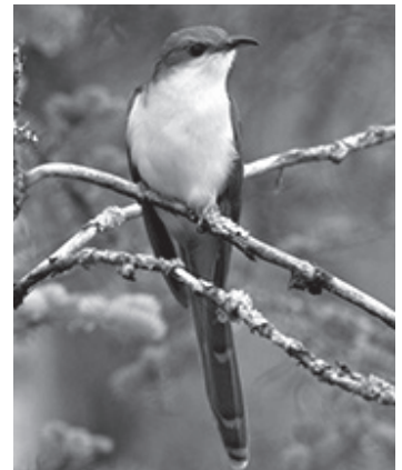
Photo: Black billed cuckoo, just one of many bird species that can be witnessed in our area.

of June is best for the birder to visit this area, just grab a Timmies and a folding chair and you are set to go. Early morning is best, and even the beginner can expect to see a minimum of thirty species. Enjoying the mild spell while we can, I have been doing plenty of good hiking; hopefully I will have some interesting content for next week's issue.