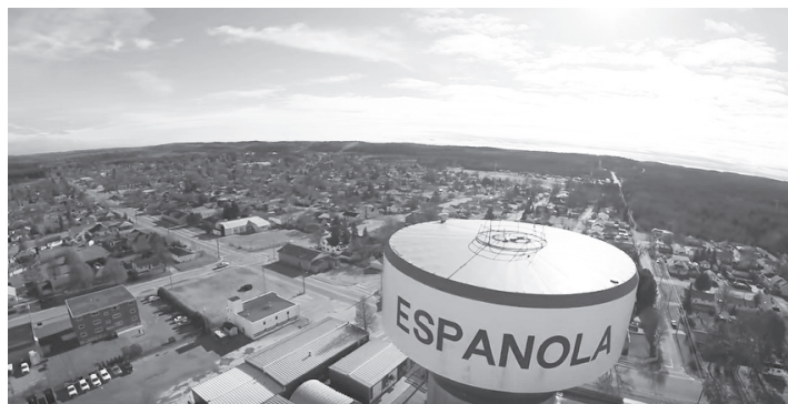
Photo: A snippet of the Espanola From Above YouTube video that was filmed by a drone in November, 2015.

A YouTube video was widely circulated recently of an aerial view of Espanola, filmed by an Unmanned Aerial Vehicle (UAV), or in layman's terms, a drone. The video is just under seven minutes, set to music and shows the water tower, recreation complex, mill and other popular sights in the town. The Ontario Provincial Police is reminding anyone operating a UAV that it is their responsibility to fly their UAV safely and legally. More and more people are using an UAV for work or pleasure and it is up to the operator to understand and obey the rules that apply to them. Not doing so could put lives at risk and cost up to $25,000 in fines.