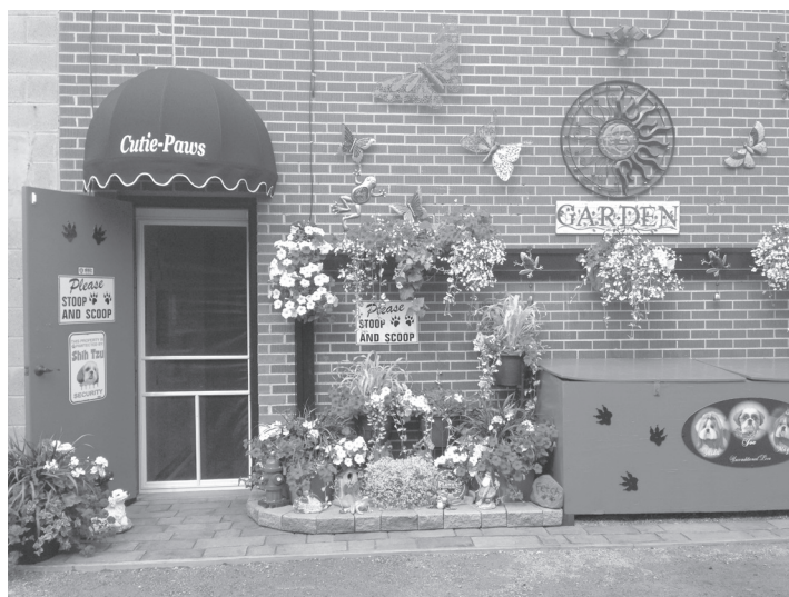
Photo: Cutie Paws Dog Grooming won the first Espanola Horticultural Society Beautification Award for its lovely displays outside the store front in the laneway off of Barber Street.