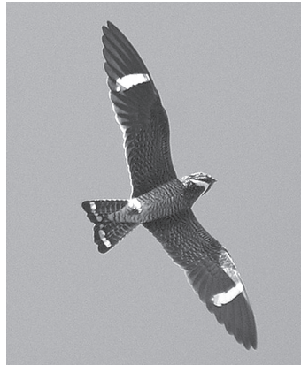
Photo: The common nighthawk in flight..