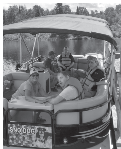
Photo: Community Living Espanola clients enjoy a cruise aboard Sno Dog.