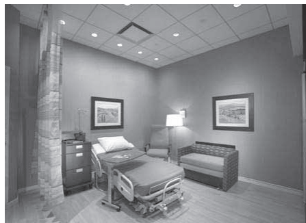
Conceptual design of the refurbished palliative care room. The Oasis chair is back right.