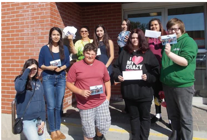
Photo: Espanola High School First Nations students drop off their letters to Prime Minister Trudeau at the Espanola Canada Post location.

On June 2, almost 100 post cards and letters were dropped into a Canada Post mailbox en route to Prime Minister Justin Trudeau's office in Ottawa. The Espanola High School First Nations students and staff pictured here are sending a clear message concerning their fellow teenagers on northern reserves such as Attawapiskat