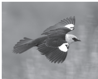
Photo: A yellow headed blackbird.