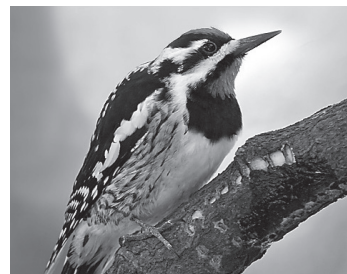
Photo: The yellow bellied sapsucker.