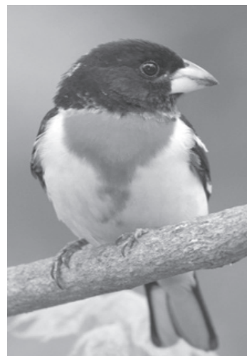
Photo: The rose-breasted grosbeak.