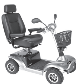
PROWLER 3410 Large Scooter

COMPACT/TRANSPORTABLE STANDARD/MIDSIZE • HEAVY DUTY SCOOTERS