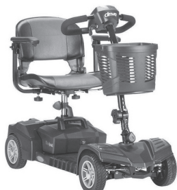
SPITFIRE SCOUT 4 Compact Travel Scooter