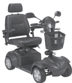
VENTURA 4 Midsize Scooter