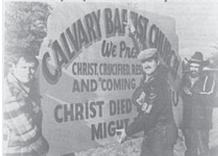
Photo: The Calvary Baptist Church original (and still standing) sign will be replaced soon as part of the church's 40th anniversary.