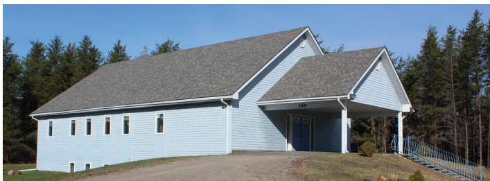
Photo: Calvary Baptist Church at 599 Barber Street, Espanola.

On May 31, Calvary Baptist Church in Espanola (CBCE) will celebrate its 40 year anniversary. Since May 31, 1976, CBCE has been actively involved in the community. From the early days of running vacation Bible schools, AWANA and bus ministry to their current programs of the Children's Clothes Closet and other training courses, CBCE remains a church committed to the community of Espanola and surrounding areas.