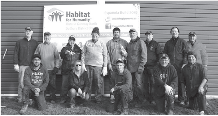
Photo: Community Living recently partnered with the Lions Club to help spread sod at the Habitat for Humanity Espanola build.

Words matter. They mattered when a student emigrated to Canada from Africa and was able to share her unique sense of home with her new classmates through a poem. "The little girl's family had a home through Habitat for Humanity, and she was able to say to her classmates 'you kids maybe haven't seen the other side of this, but know we have a chance to change it. We can make a difference.'"