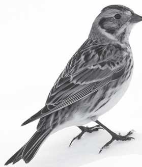
Photo: A lapland longspur.