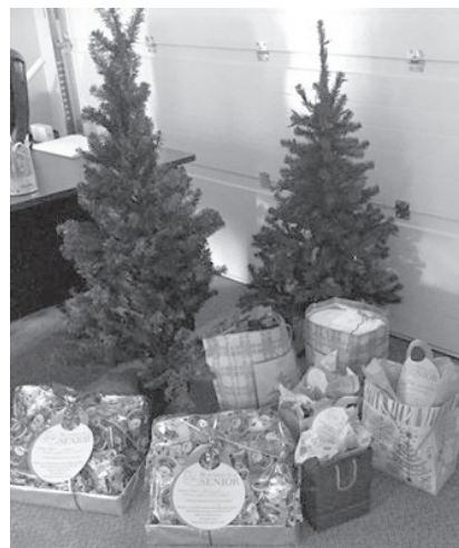
Photo: Look for a Be A Santa To A Senior Christmas trees with ornaments around Espanola.

bags of warm items (hats, scarves and gloves) were distributed by VON as a result.