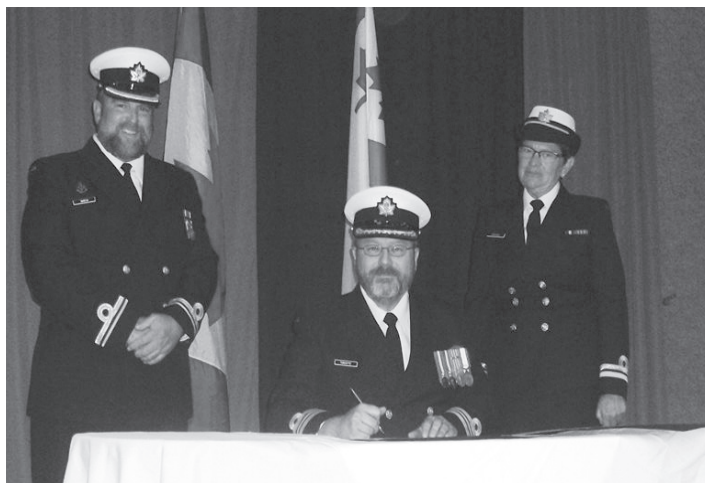
Photo: Signing of the certificates.