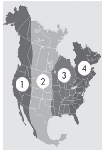
Photo: Migration flyway zones map: 1) Pacific, 2) Central, 3) Mississippi, 4) Atlantic.

birds navigate their journey. Some of Canada's arctic nesting birds can navigate a round-trip migration of 24,000 kilometres, and in the case of the arctic tern, much further.