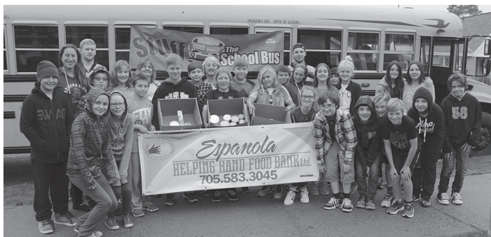
Photo: Crystal Guillet's grade 6 class at A.B. Ellis collected the most number of items for Stuff the Bus at their school.

The Espanola Helping Hand Food Bank is again the beneficiary of the Stuff the Bus campaign. It is important to keep the shelves stocked year-round at the well-used food bank, but especially so leading