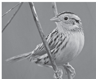
Photo: A Le Conte's sparrow.