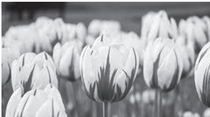
Photo: Canada's 150th anniversary commemorative white and red tulips are being planted now in anticipation of the country's milestone birthday next year. Both Espanola and Webbwood are looking for volunteers to help with their upcoming bulb plantings.

Canada's 150th anniversary is next year and to celebrate the country's proud history, the Canadian Garden Council has introduced a special red and white commemorative tulip.