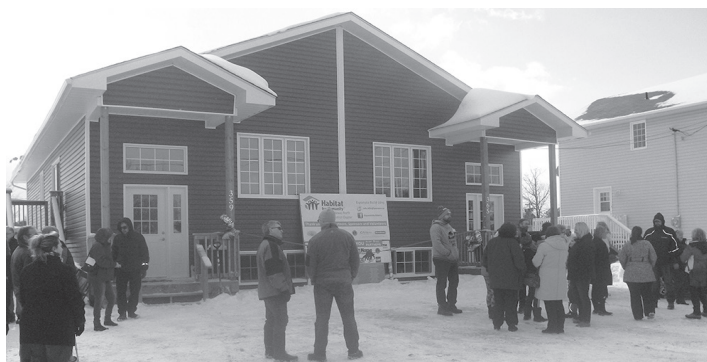
Photo: About 80 people attending the Habitat Key Turning Ceremony on Sunday, February 7, 2017 to celebrate the successful construction of this duplex home on Adelaide Street in Espanola.