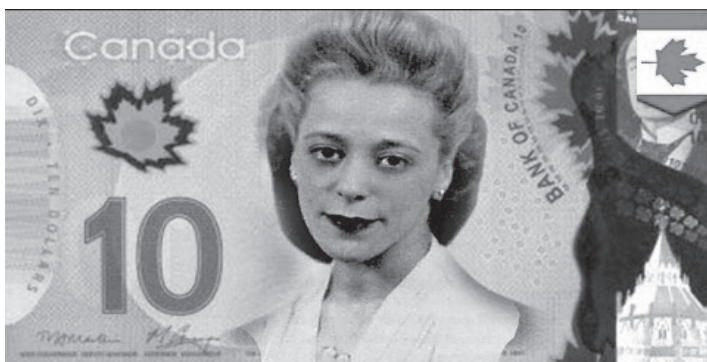
Photo: Photo of Viola Desmond $10 bill provided by Government of Canada - media branch

The Ontario Black Historical Society is the organization in Canada that successfully initiated the formal celebration of February as Black History Month with the City of Toronto (1979), the Province of Ontario in 1993 and the entire country effective February 1996.