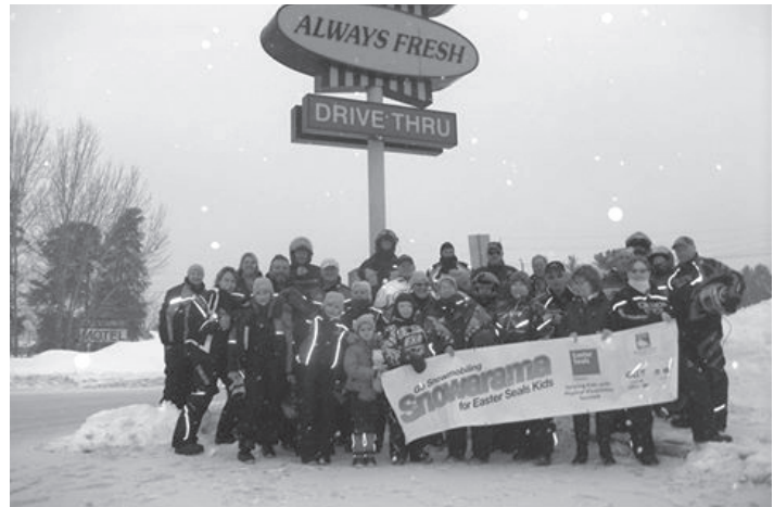
Photo - The 35 participants of this year's Espanola Snowarama had plenty of powder to play in at this year's event, they also were full of smiles raising $6,519 for Easter Seals.

The annual event to raise funds for Easter Seals, which provides equipment and other supports, including camps for children with disabilities, exceeded its goal this year.