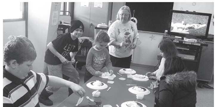
Photo - Children were able to take part in various crafts hosted by the Espanola Public Library