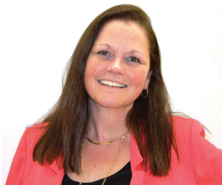
Photo: Nicole Haley, CEO of Espanola Regional Hospital and Health Centre - file photo

The North East Local Health Integration Network (NE LHIN) announced the local hospital will be receiving $233,500 from the 2017 provincial budget. In total, the government is expected to put $23 million into various hospitals.