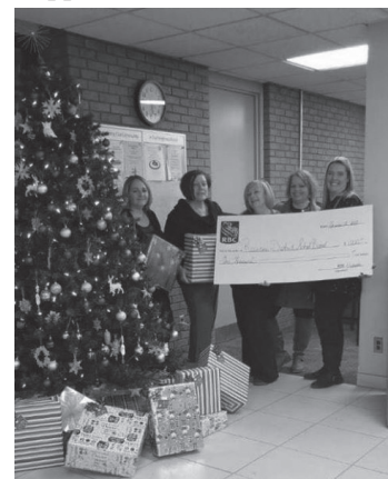
Photo of staff doing their seasonal best to make Christmas brighter.

The Espanola Regional Hospital & Health Centre, Management, Staff and Boards, wish you and your family a healthy, happy and safe holiday season. All the best in the New Year!